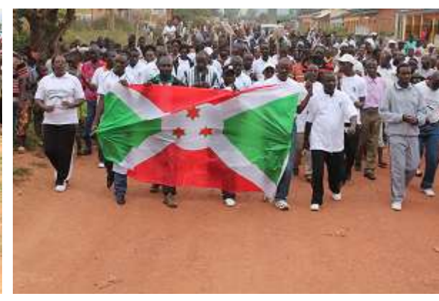
Youth walk (Gitega province) Youth walk (Karusi province)