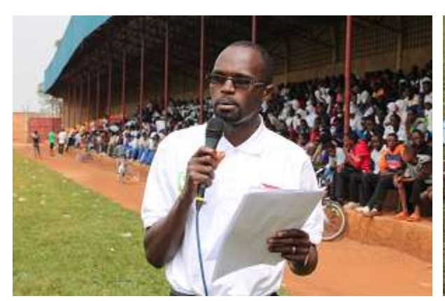
Youth ambassador for ratification of Ngozi commune