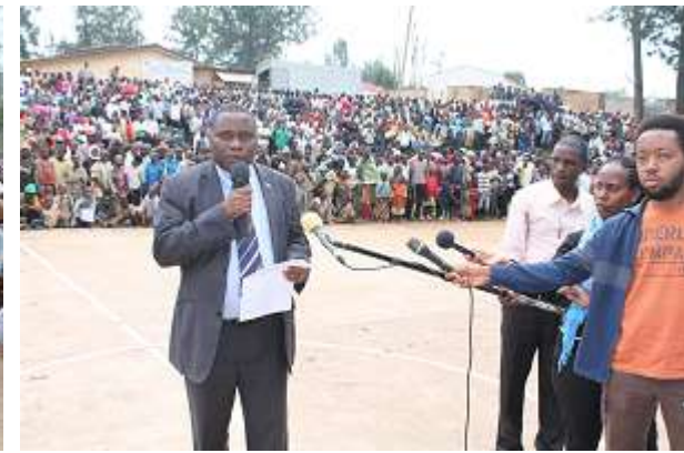
Permanent Secretary at the Ministry of Youth, sports and culture (interview)