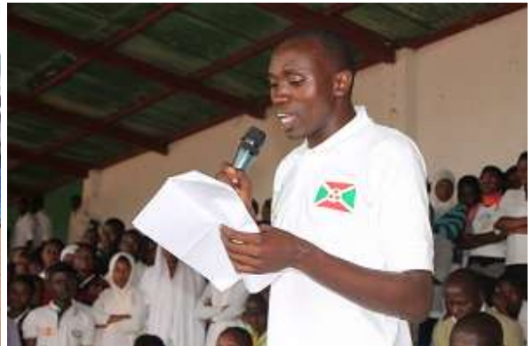
Legal Representative of YOWLI BURUNDI