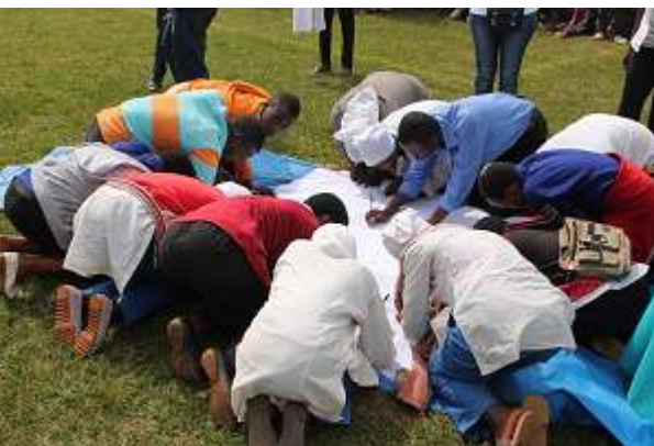
Youth ambassadors for ratification writing their recommendations during campainins