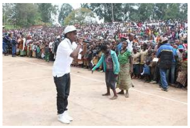
Musician Black G dancing with youth (Ngozi province)